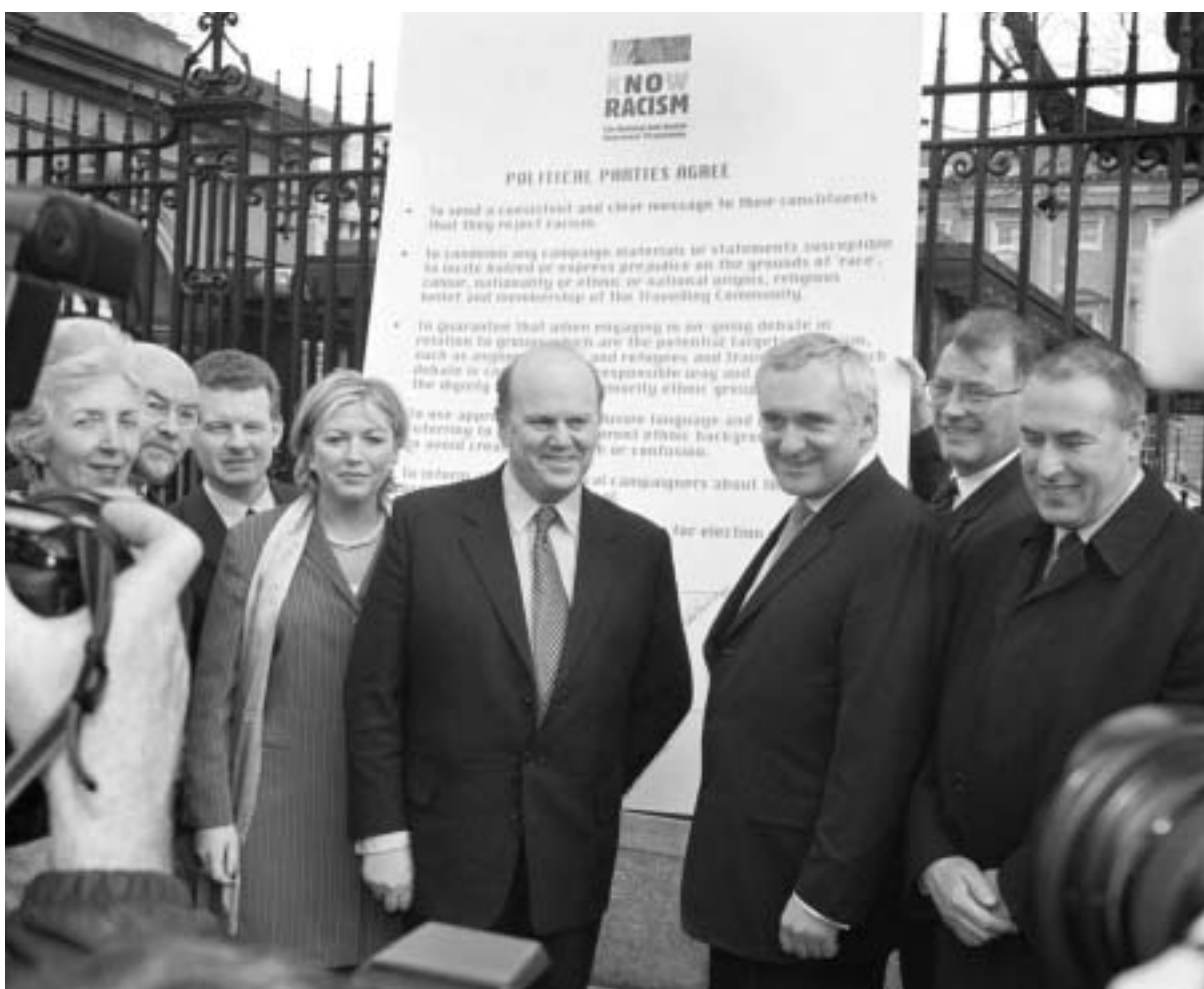
Leaders of political parties and representatives of the NCCRI and Know Racism at the launch of the political protocol, June 2001 (see para. 192)