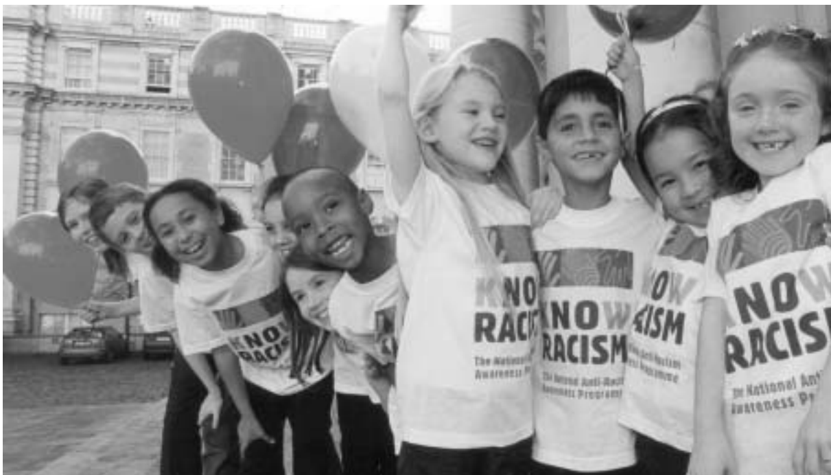
Children outside Government Buildings at the Know Racism launch, October 2001.

372. This report outlines the measures that have been put in place to bridge the gap between aspiration and reality. Demonstrating Ireland's commitment to bridge that gap urgently, effectively and permanently, this report will be a touchstone for progress over the coming years.