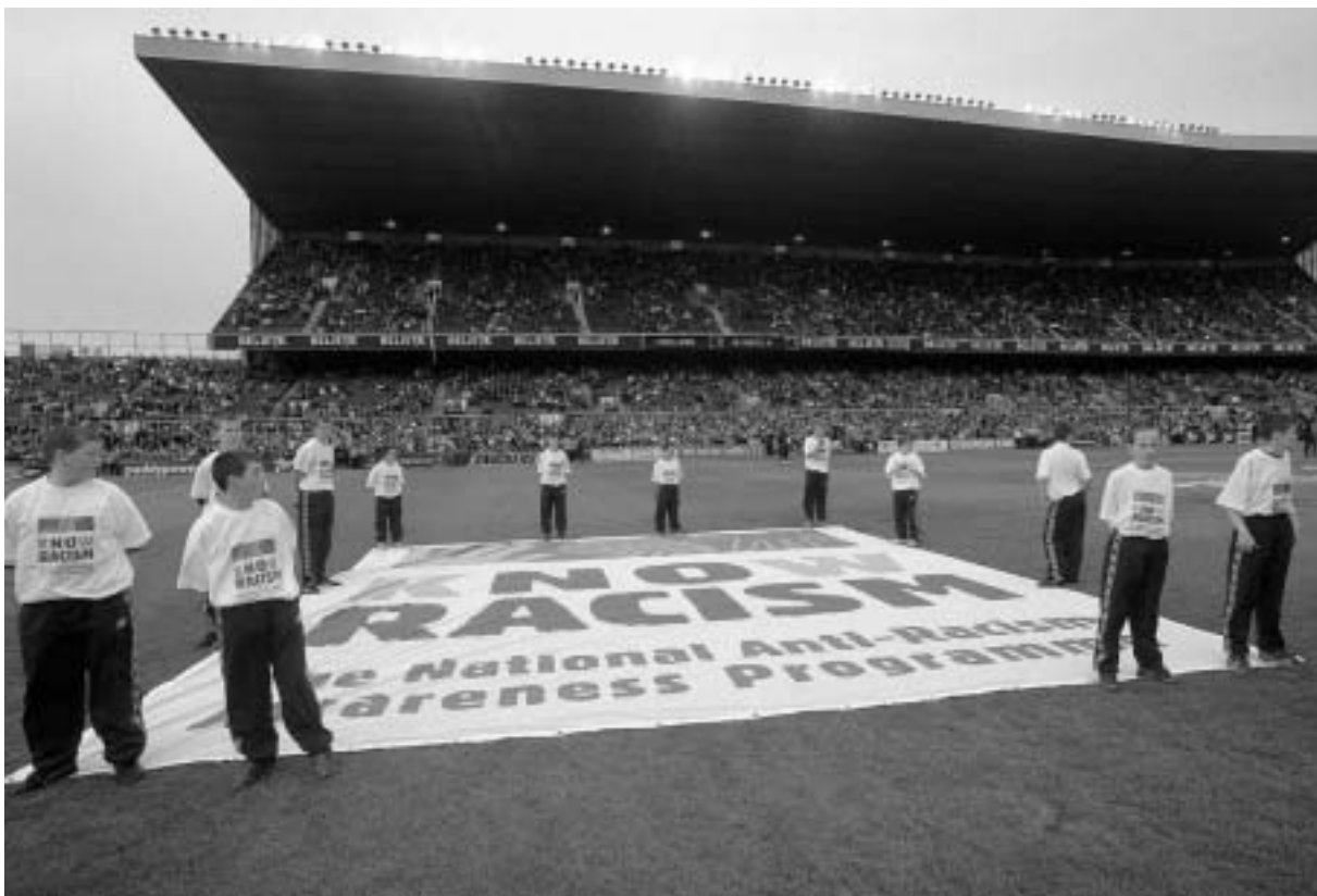
The Know Racism banner is displayed in Lansdowne Road stadium prior to an Ireland-Iran soccer match, November 2001.

202. The Government intends to publish the action plan in early 2004.